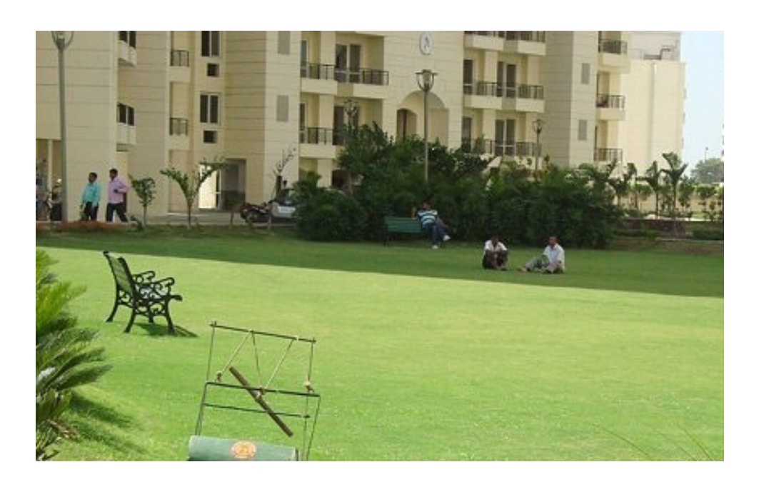
"Our Nature is Our Future"!!