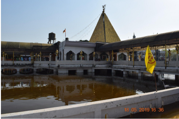
Before starting treatment (18.5.2019)