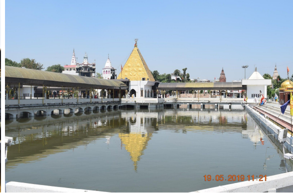
After 12 hours of treatment (19.5.2019)