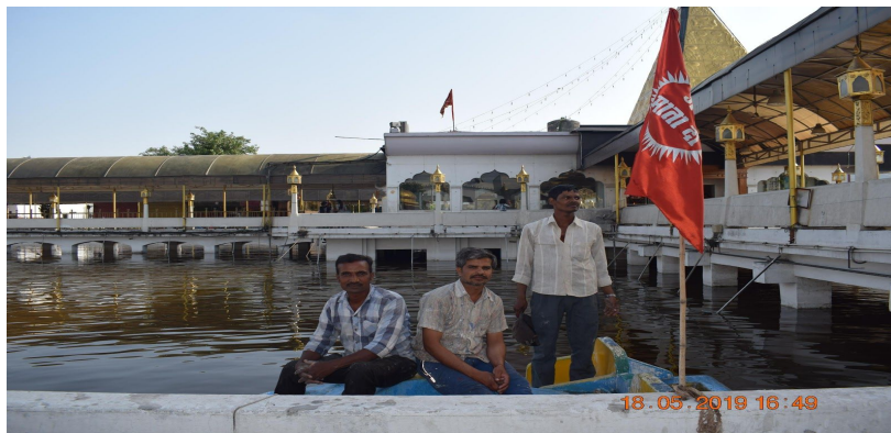
DTMPC team participated in dosing BioTic Water Treatment Solution

Solution provided by BioTic: OXIBON (Liquid based)